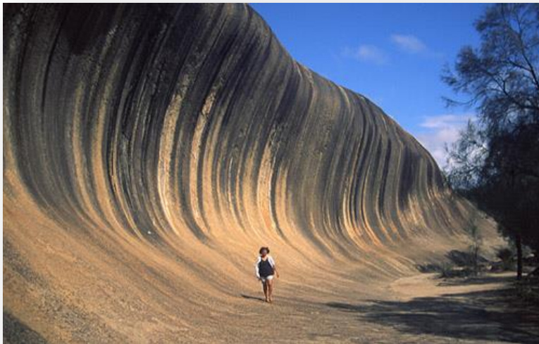
Wave Rock, Hyden