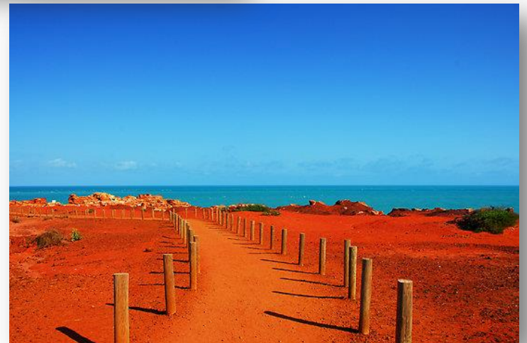
The Kimberleys, Broome