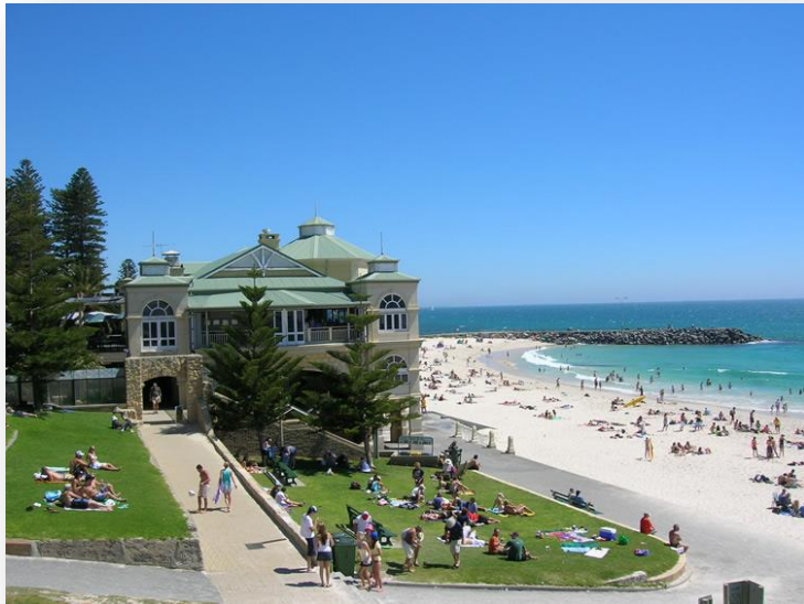
Cottesloe Beach, Perth